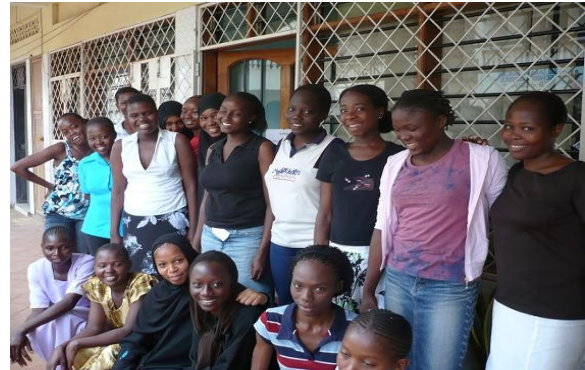
Some of the girls who attended the girl's day.

The girls were also given a chance to address any issues they had with a SAAS councillor in private and to offer their opinions on various topics. At the end of the day all girls were given sanitary towels.