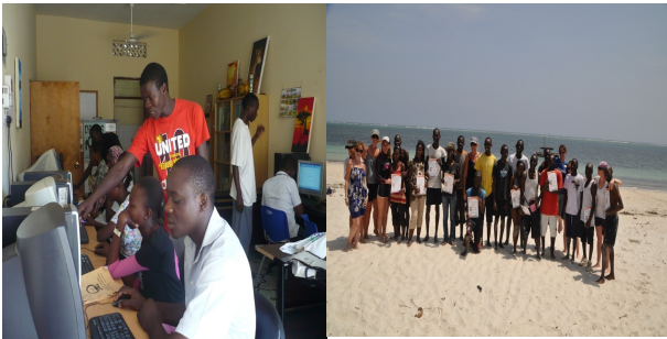
Left Photo students in the computer class, Right Photo previous students receiving their certificates from SAAS Sponsors during the Month of January 2012.