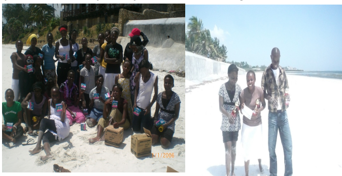
Fun Day at Mombasa Beach