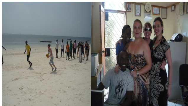
From Top left, SAAS Youth Group and Donors taking a photo after a Bowling game, Right At Haller Park